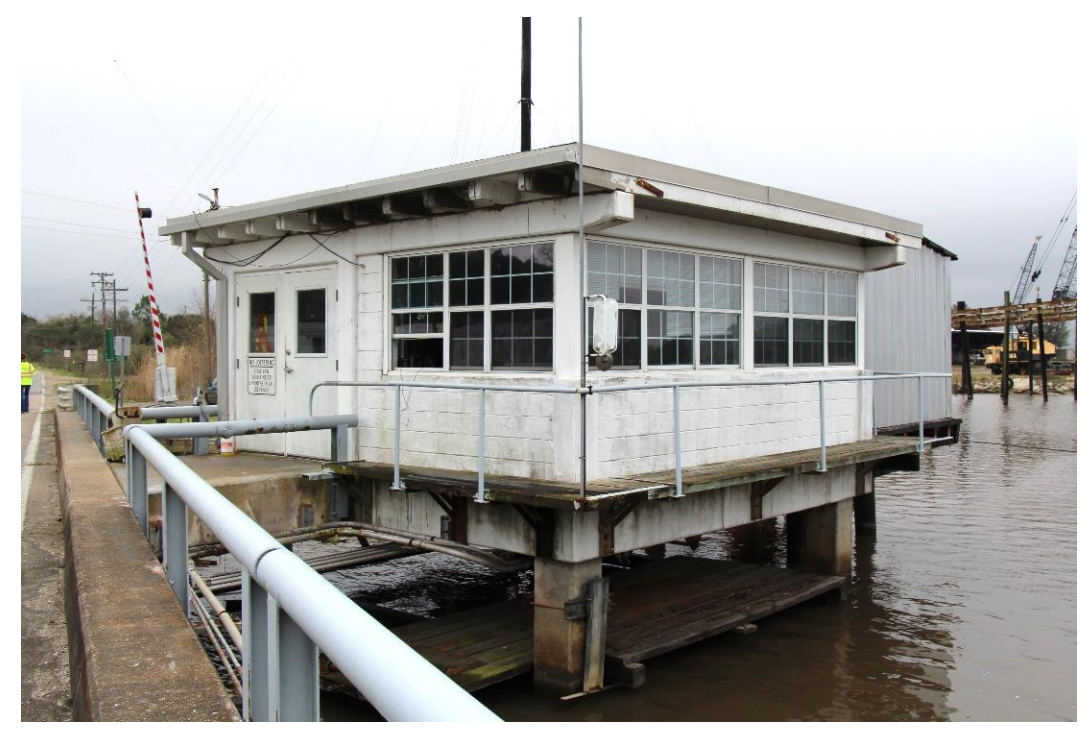
Historic Fabric Photo 3: Operator's house (shed for hydraulic equipment in background is not considered historic fabric).