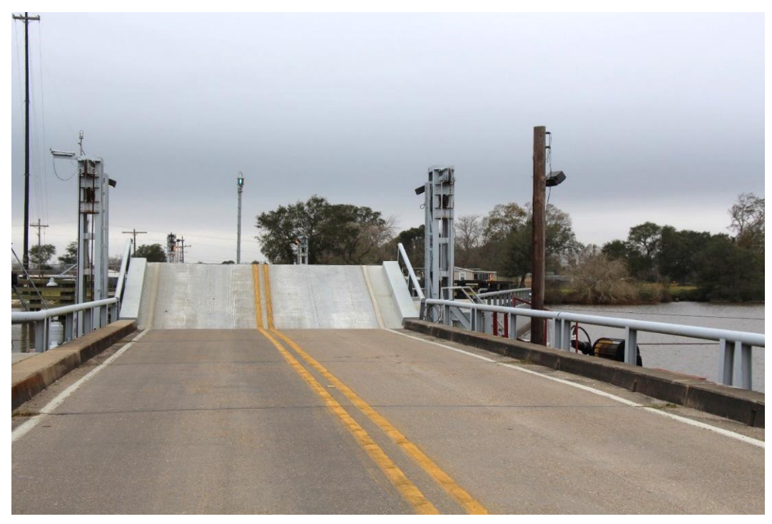
Condition Photo 2: Typical approach apron lift span showing steel plate rotated vertically.