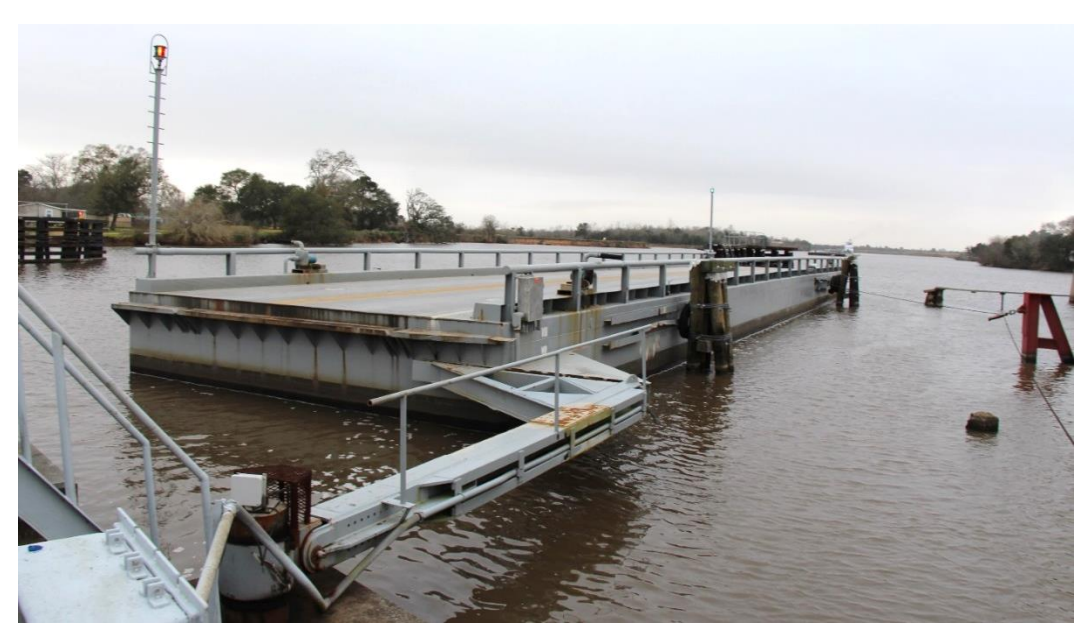
Character-defining Feature Photo 2: Design and construction of a pontoon swing span including the pivot arm, the two approach apron lift spans, and the four lift towers. The main swing span (open), showing the pontoon and pivot arm.