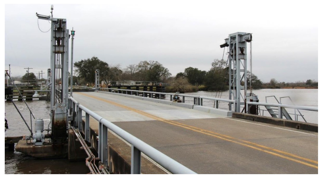
Character-defining Feature Photo 1: Design and construction of a pontoon swing span including the pivot arm, the two approach apron lift spans, and the four lift towers. The main swing span (closed) with floating pontoon and east apron lift span with lift towers.

This feature includes the main swing span, comprised of the pontoon, the pivot arm, the two approach apron lift spans, and the four lift towers.