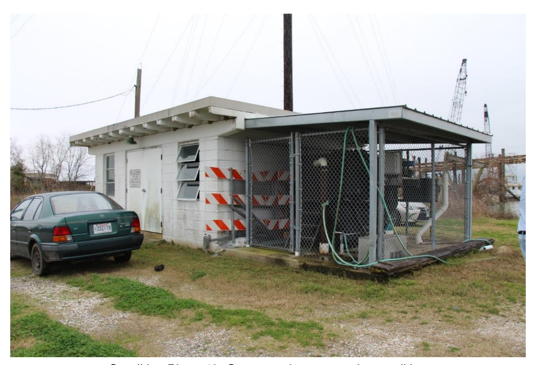
Condition Photo 12: Generator house exterior condition.