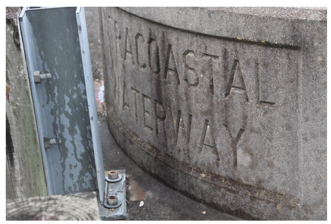
Historic Fabric Photo 2: End posts with recessed panel with "Intracoastal Waterway" in inscribed lettering.