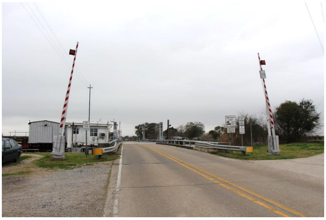
Condition Photo 3: Traffic warning gates and signals at the east approach roadway.