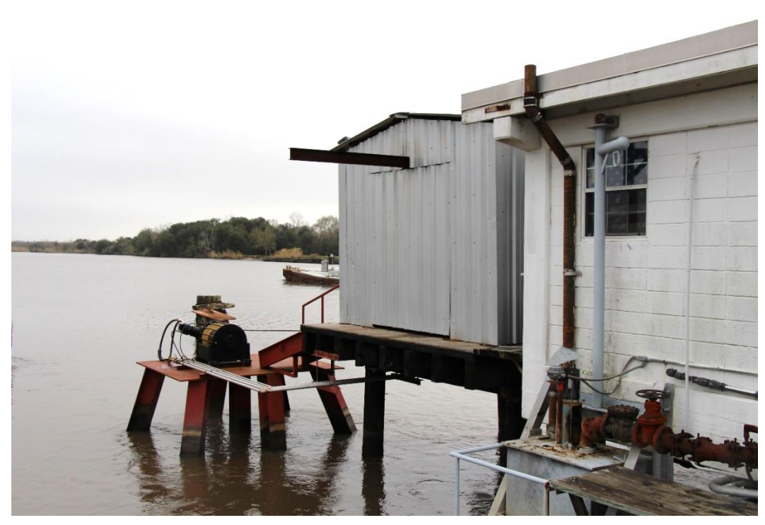
Condition Photo 11: Operator's house and hydraulic equipment shed exterior condition. Also note hydraulically operated winch mounted on pile supported platform.