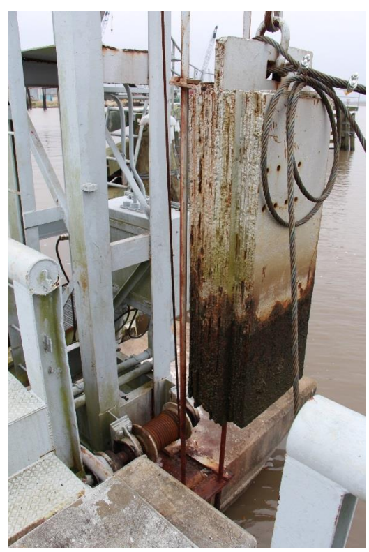
Condition Photo 5: Condition of approach apron lift tower. Rust, corrosion, and section loss on counterweight and counterweight guide bars typical for four counterweights.