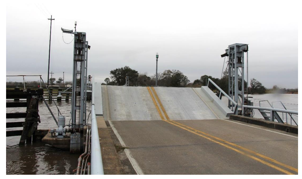
Character-defining Feature Photo 4: Design and construction of a pontoon swing span including the pivot arm, the two approach apron lift spans, and the four lift towers. The approach apron lift plate shown raised vertically.