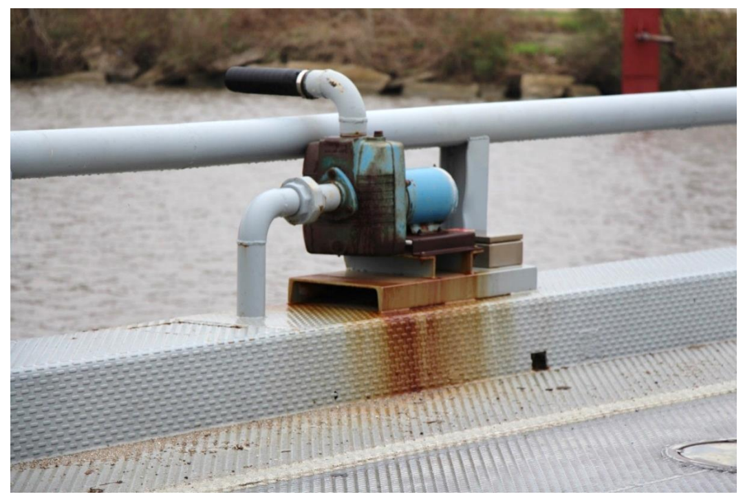
Condition Photo 7: Pontoon pump, one on each corner of pontoon span. The surface rust on the leveling pump and platform is typical for all four pumps.