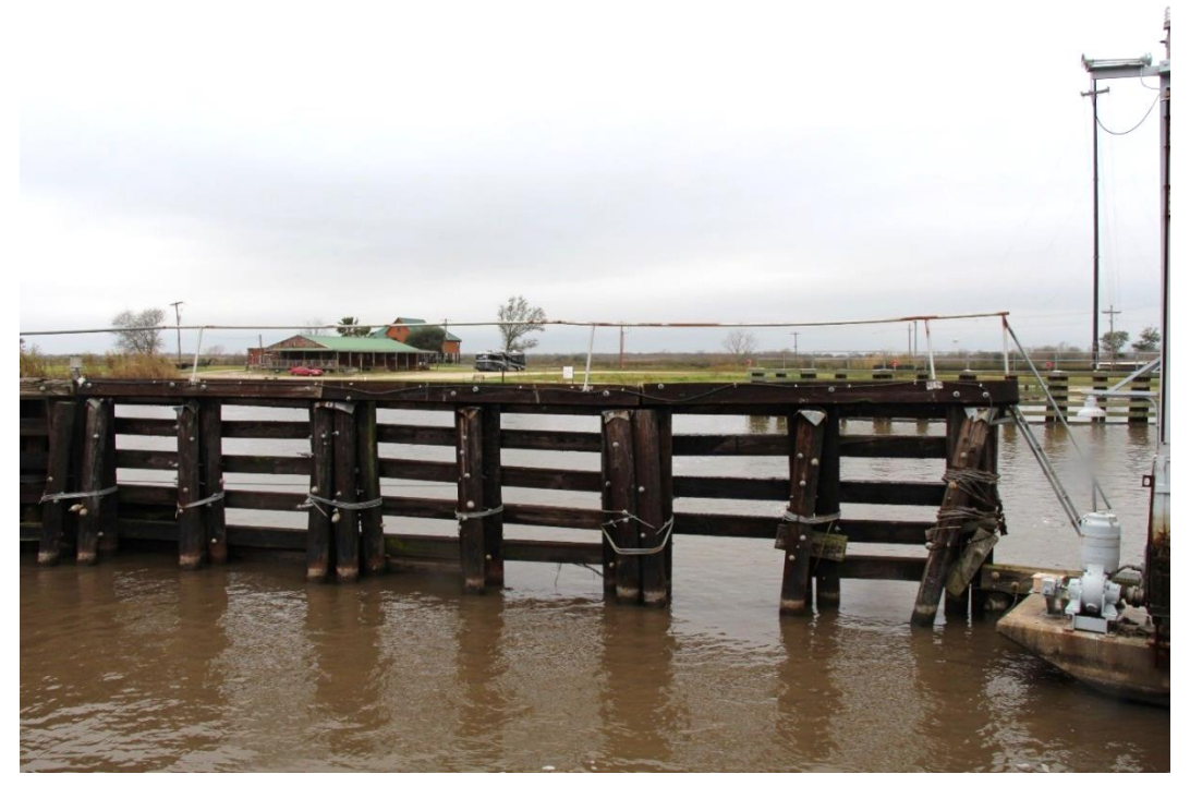
Condition Photo 15: Missing horizontal member and metal railing on southeast timber fender.