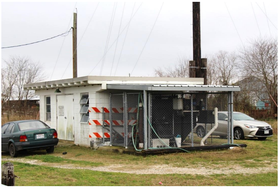
Historic Fabric Photo 4: Generator house.