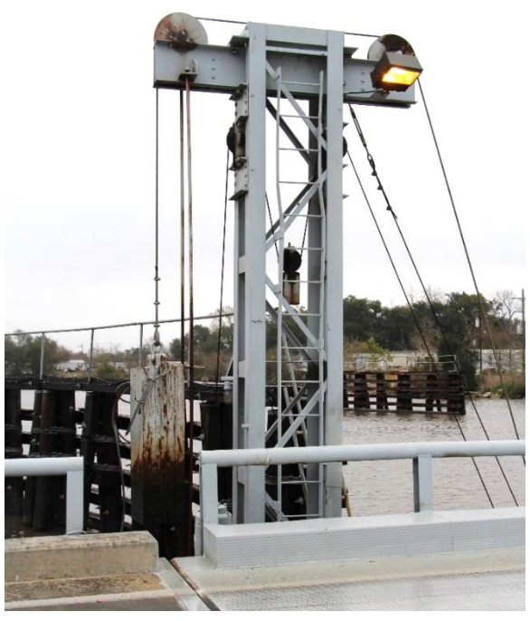
Character-defining Feature Photo 3: Design and construction of a pontoon swing span including the pivot arm, the two approach apron lift spans, and the four lift towers. Detail of a lift tower with counterweight, sheaves, and steel cables.