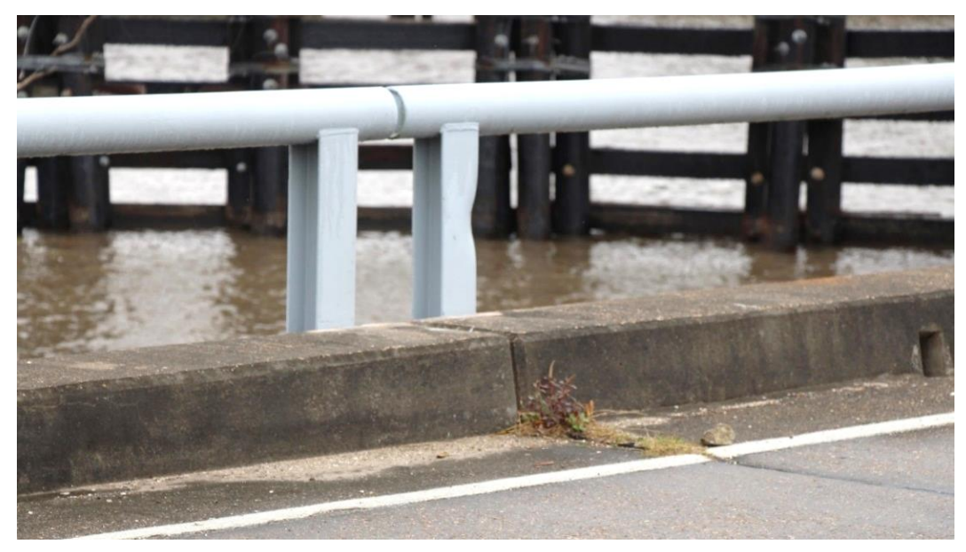
Condition Photo 6: Debris and vegetation on bridge deck, typical on approach spans. Photo also shows condition of railing.