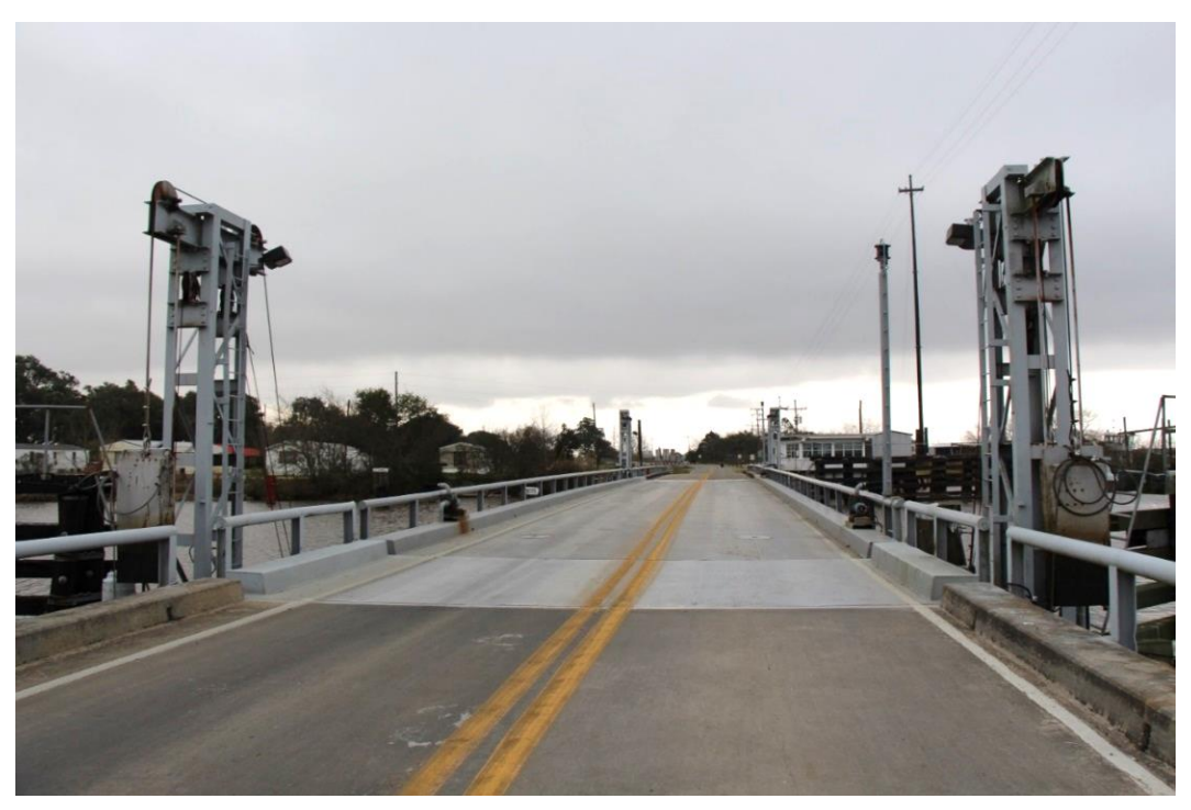
Condition Photo 1: Overview of pontoon swing span.

Underwater inspection report: May 27, 2014 Date of site visit: February 2, 2016