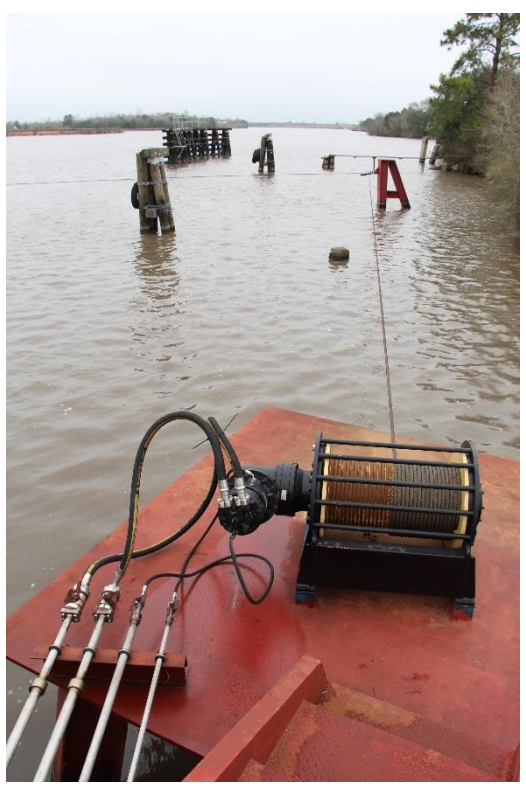
Condition Photo 14: Operating machinery, hydraulically operated winch and cable system, including foundation supports. Note: the winch has been replaced with a system that keeps the cables out of the water.