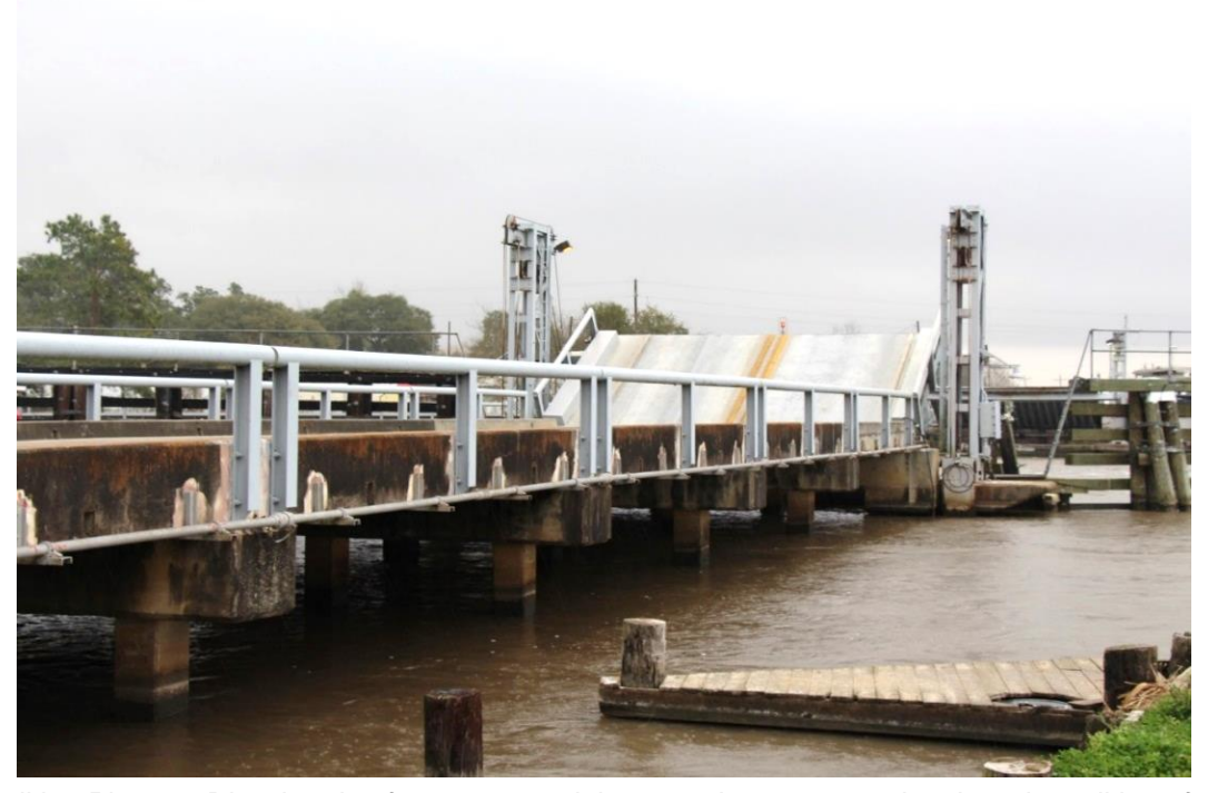
Condition Photo 4: Discoloration from water staining on substructure and curb and condition of steel railing (west approach spans shown).