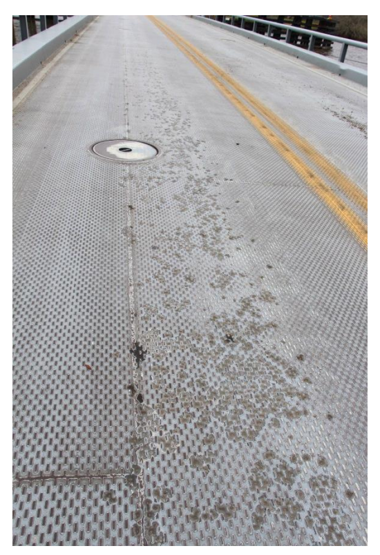
Condition Photo 9: Minor pitting in steel deck on eastbound traffic lane of the pontoon swing span.