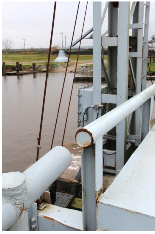
Condition Photo 8: Localized paint failure on steel pipe railing, typical throughout the bridge.