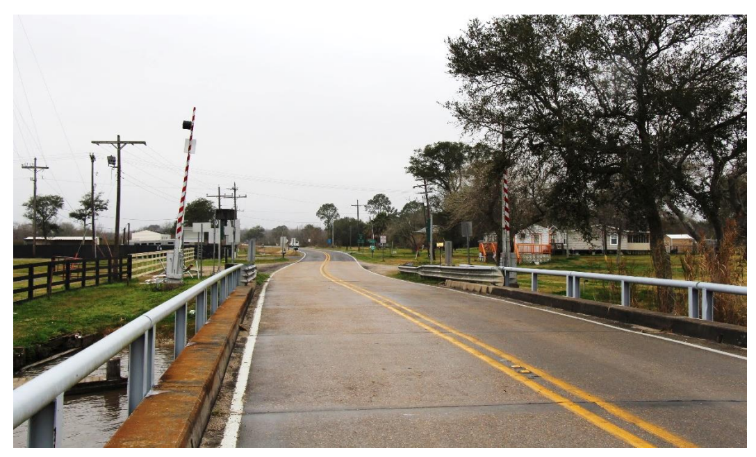
Historic Fabric Photo 1: Concrete approach spans.

The following images illustrate other bridge features that are of historic fabric, meaning they are part of original construction but are not considered to be character-defining features: