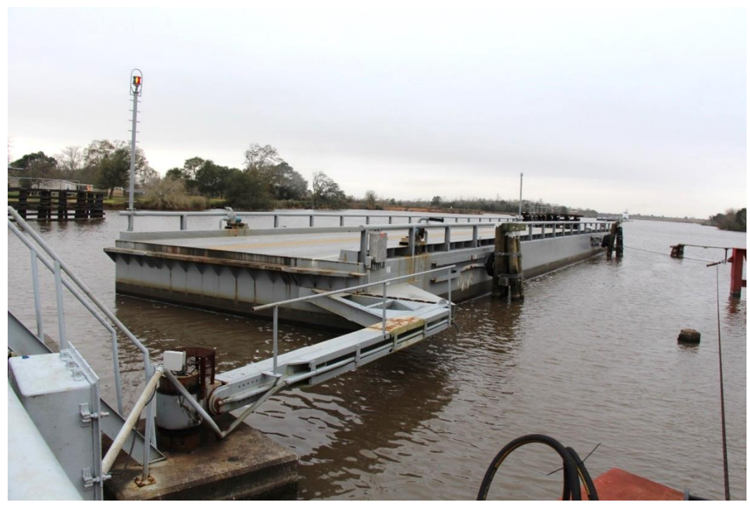
Condition Photo 13: Pontoon swing span in the open position showing pivot arm and support for the pivot arm.