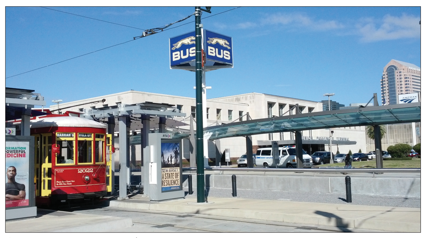
▲ Figure 4: The existing Amtrak/Greyhound station, located near the Superdome in Downtown New Orleans, has capacity for additional rail service.

from Amtrak or another provider. Amtrak is currently working with several Midwestern states to complete a major procurement of locomotives and bi-level coaches. Once this new equipment is delivered some of the locomotives and single-level coaches currently being used on Midwest routes will be taken out of service. This equipment could be rehabilitated and made available for service between Baton Rouge and New Orleans. As ridership grows and service levels increase, it will be appropriate to consider purchasing new equipment for this corridor.