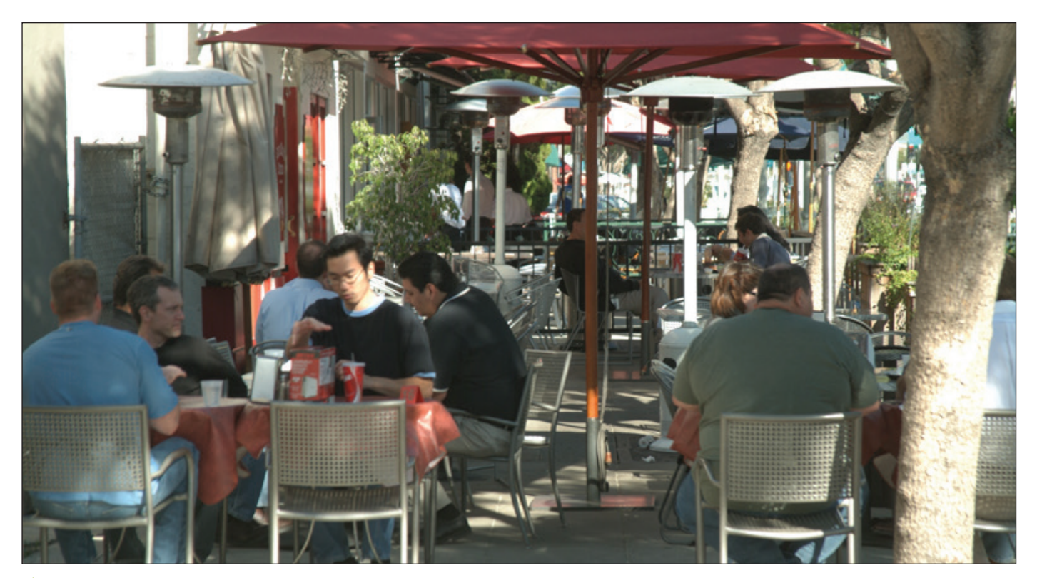
▲ Figure 2: By supporting the new rail travel mode, localities can concentrate and enhance development at station locations.

passengers rather than drivers and be more productive during their trip. Passenger rail service provides an attractive transportation alternative to automobile travel in the congested I-10 corridor.