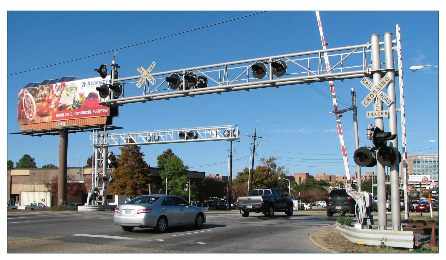
Figure 7: Gates and flashing lights will be installed at all public grade crossings on the corridor.

service. The proposed improvements include the replacement of 50% of the ties and resurfacing of all mainline and siding tracks to allow for an upgrade to Federal Railroad Administration (FRA) Class IV standards, which will accommodate passenger train speeds up to 79 mph.