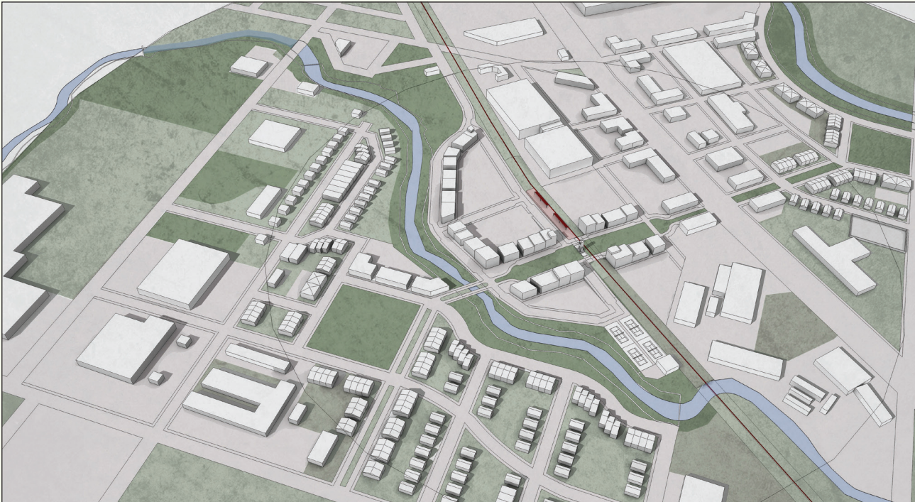
▲ Figure 5: Ascension Parish and Gonzales Station Area, Existing and Potential Full Build-Out