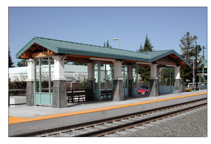
Figure 3: A rail station can function with just a platform, ticket kiosk, and surface parking lot. However, a well-planned rail station can become a valuable community asset.

A local community can use a variety of regulatory tools to encourage this type of development, including overlay zoning districts, planned unit