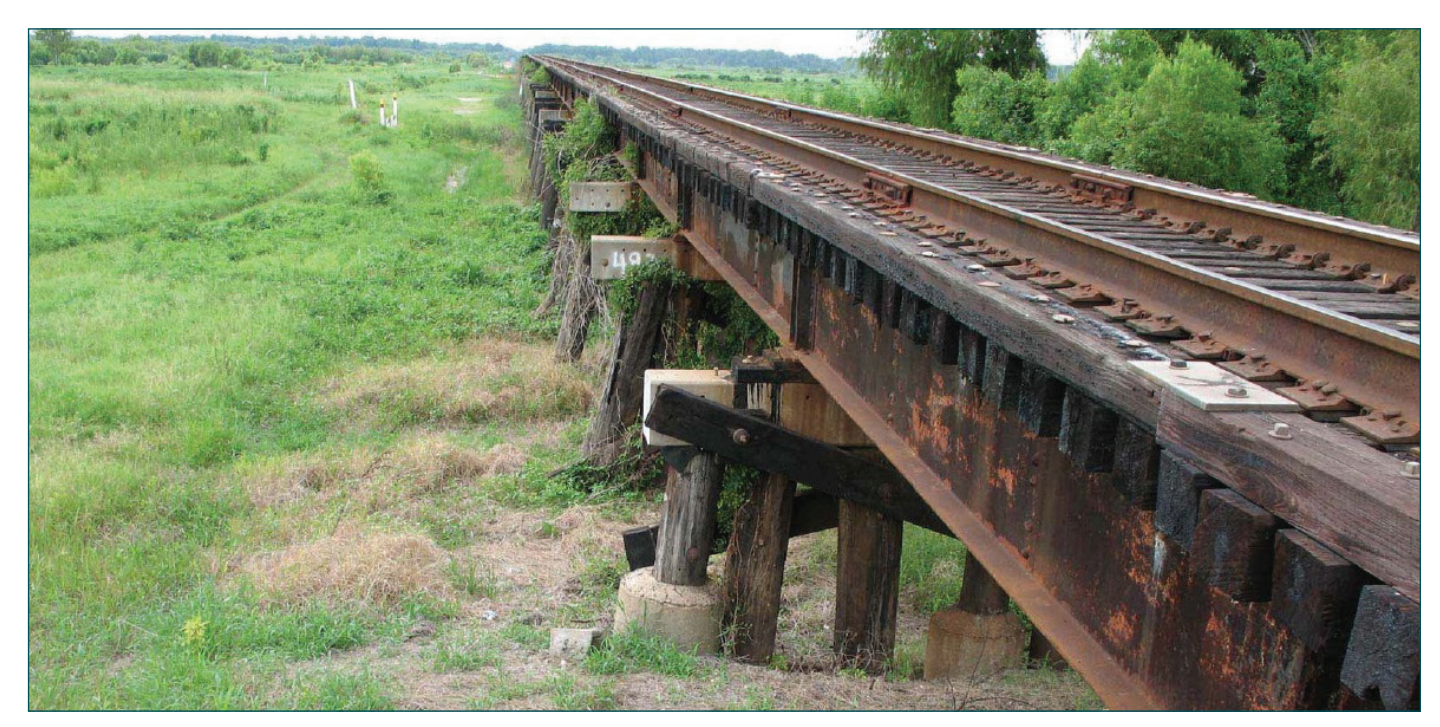
Figure 8: The single track Bonnet Carre Spillway Bridge, with its 10 mph speed limit, is a major impediment to the growth of the freight traffic on the rail line.