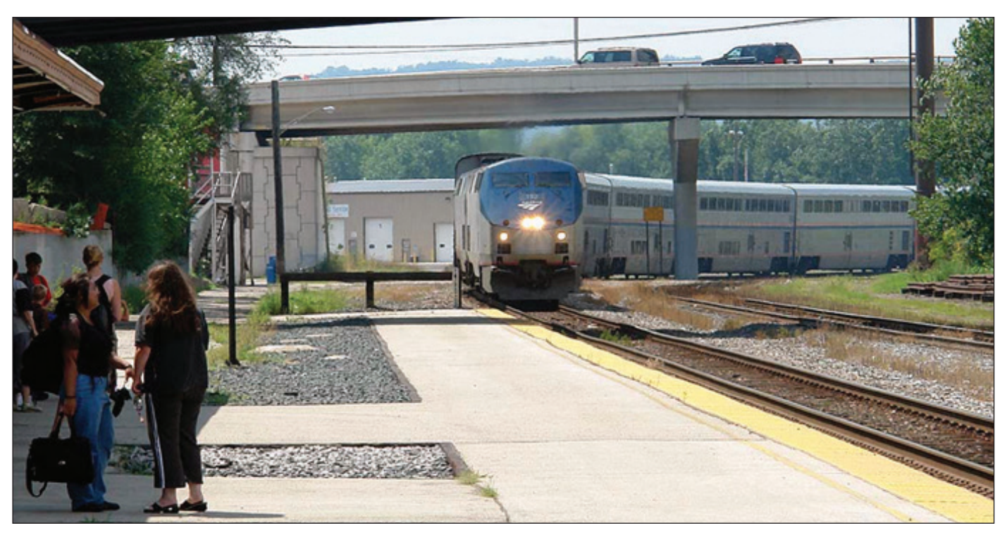
Figure 7: Reliable and convenient rail service can provide an attractive transportation alternative for residents and visitors and help support economic growth of the region.

This feasibility study is being led by a regional coalition consisting of the New Orleans Regional Planning Commission, the Capital Planning Commission and the Baton Rouge Area Foundation. This coalition remains committed to this project and will lead the project into the next phase. Ultimately other organizations including the Louisiana Intrastate Rail Compact, the Southern Rail Commission and the Louisiana Department