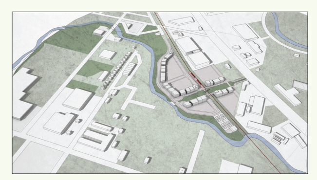
Figure 6: Ascension Parish and Gonzales Station Area, Phase I Development