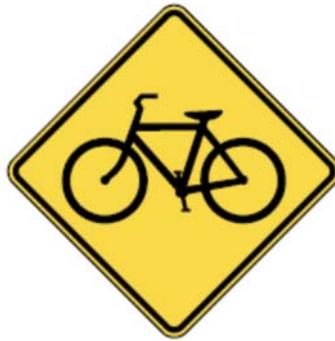
Figure 9B.2.1 Share the Road Assembly