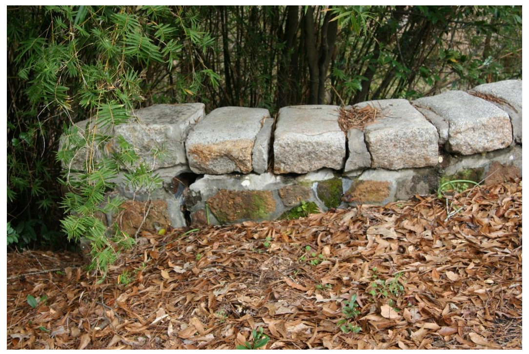
Condition Photo 13: Condition of mortar joints on northwest wingwall and capstones.