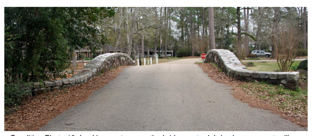
Condition Photo 10: Looking east across the bridge; note debris along parapet railings.