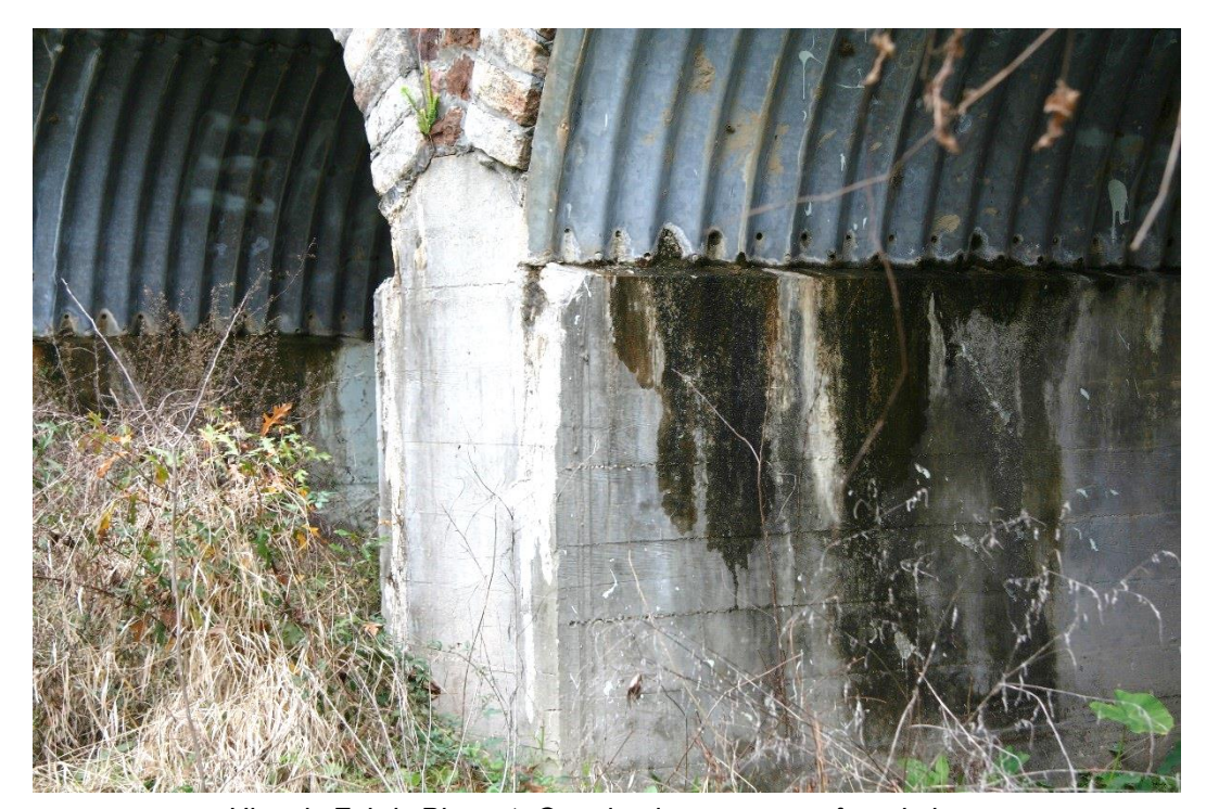
Historic Fabric Photo 1: Cast-in-place concrete foundations.

The following image illustrates another bridge feature that is of historic fabric, meaning part of original construction but not considered to be a character-defining feature: