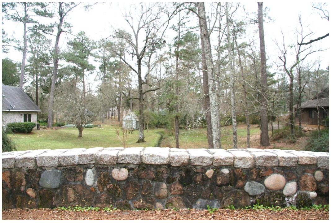
Condition Photo 4: Bridge parapet railing with capstones, looking south (upstream).