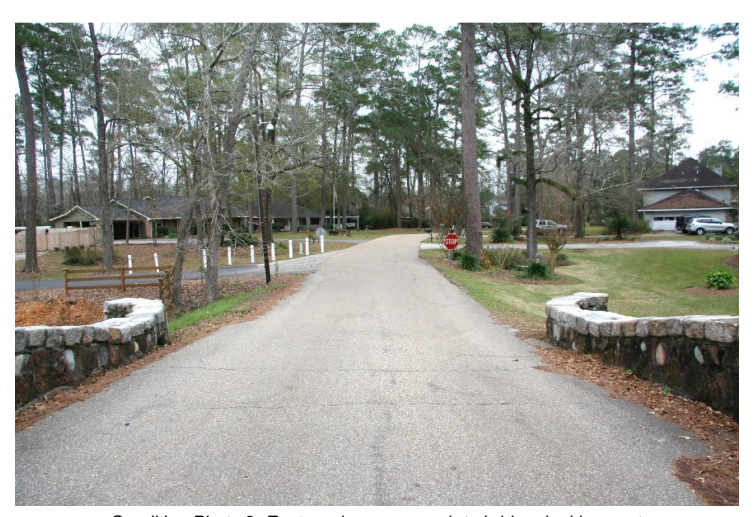
Condition Photo 2: East roadway approach to bridge, looking east.