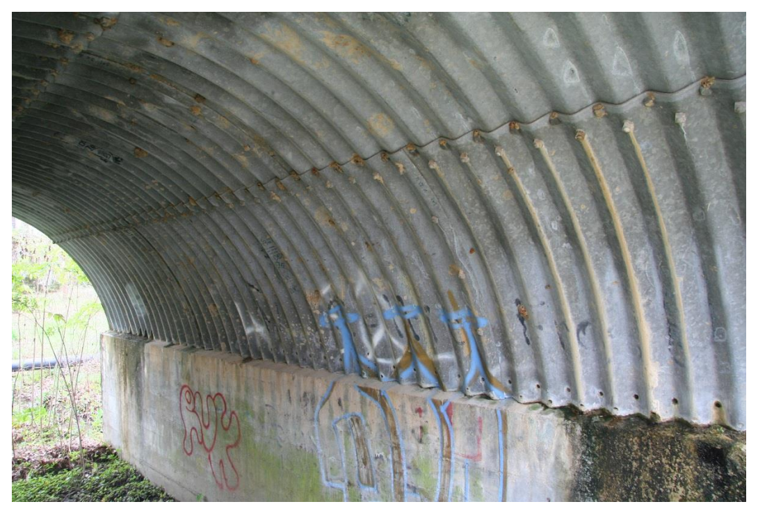
Condition Photo 9: Condition of metal liner plate detail.