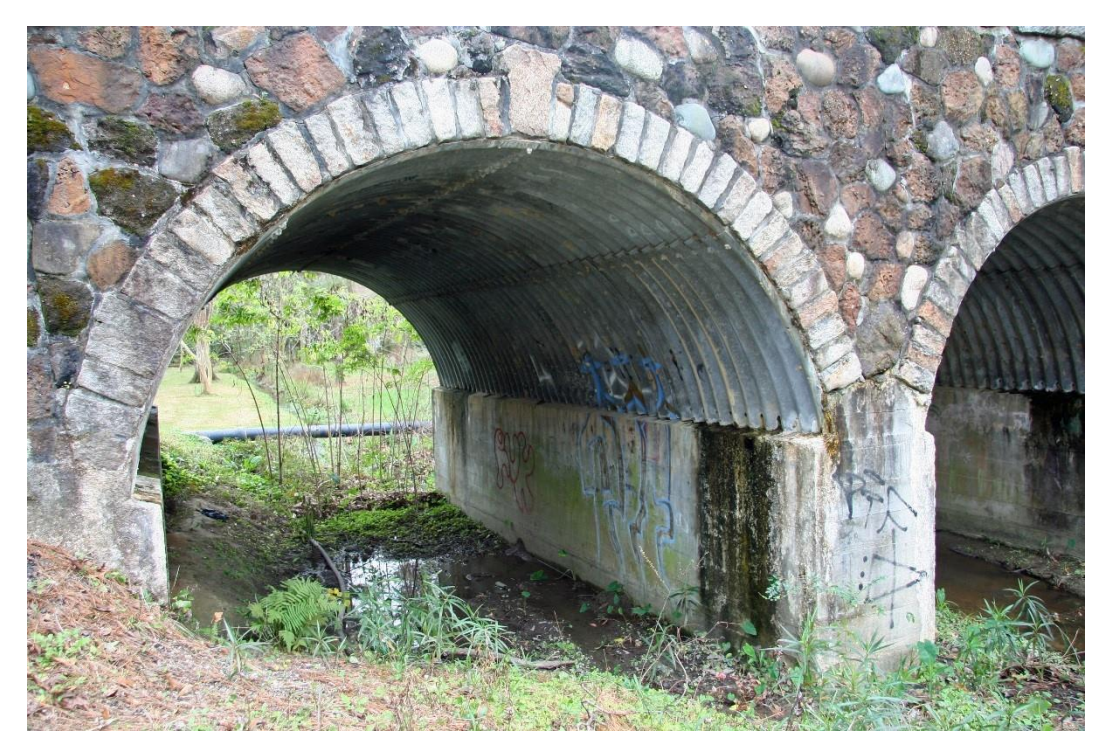
Character-defining Feature Photo 1: Design and construction of a galvanized, corrugated, metal, multiplate arch culvert with arches consisting of multiple liner plates that comprise the arch barrels.