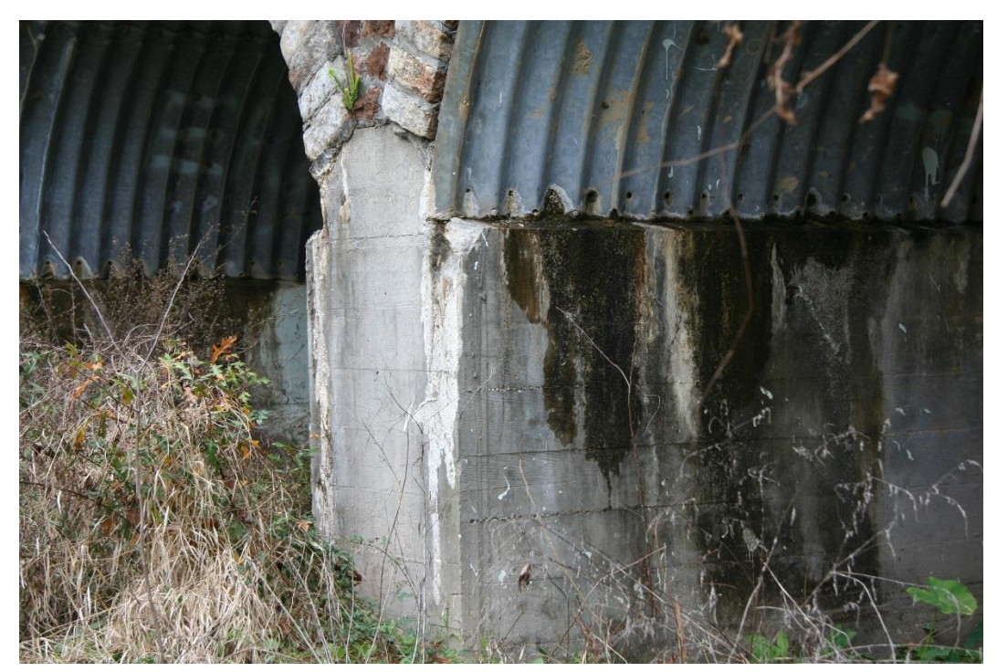
Condition Photo 11: Condition of cast-in-place concrete foundation walls and metal liner plate detail.