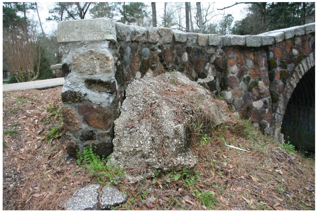
Condition Photo 6: Northeast wingwall; note mortar joints repairs and large chunk of concrete.