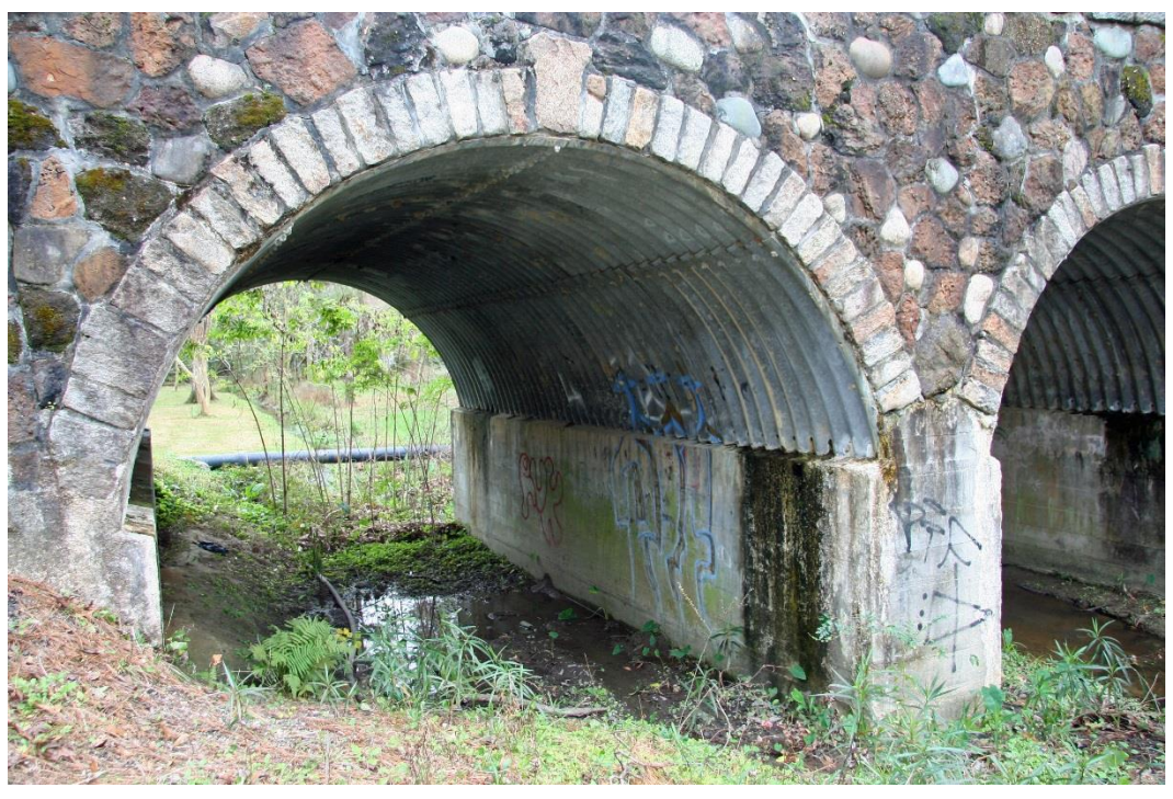
Condition Photo 8: Condition of easterly arch span; note graffiti on arch metal liner plates and cast-inplace concrete foundation walls.