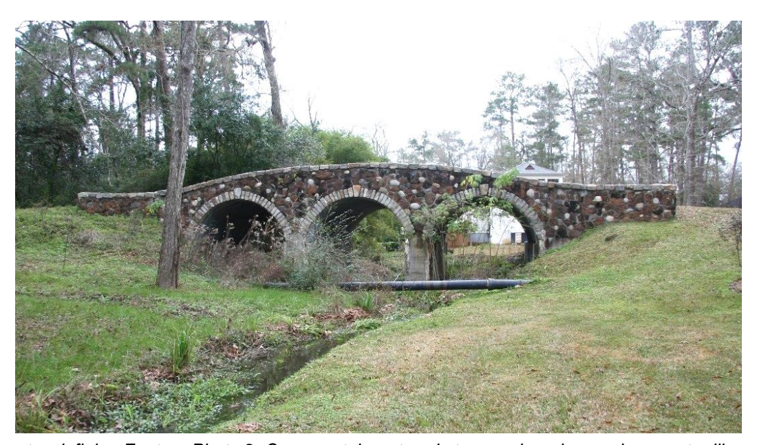
Character-defining Feature Photo 2: Ornamental mortared stonework and curved parapet railings with capstones that contribute to its high artistic value.

This features includes its ornamental mortared stonework. The stonework includes random-coursed stone with stone voussoirs and keystones and curved parapet railings with capstones.