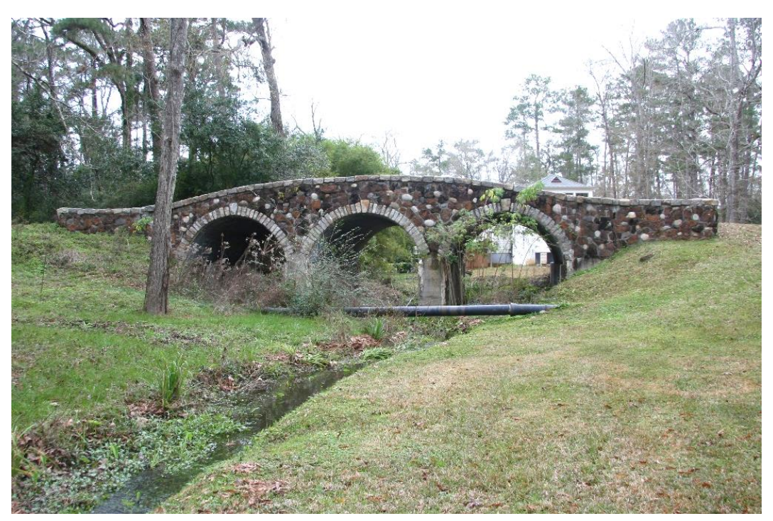
Condition Photo 1: Profile view of south (upstream) side of bridge, looking north.