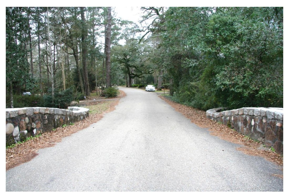
Condition Photo 3: West roadway approach to bridge, looking west.