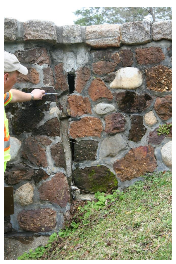
Condition Photo 12: Condition of southeast wingwall stones and mortar joints.