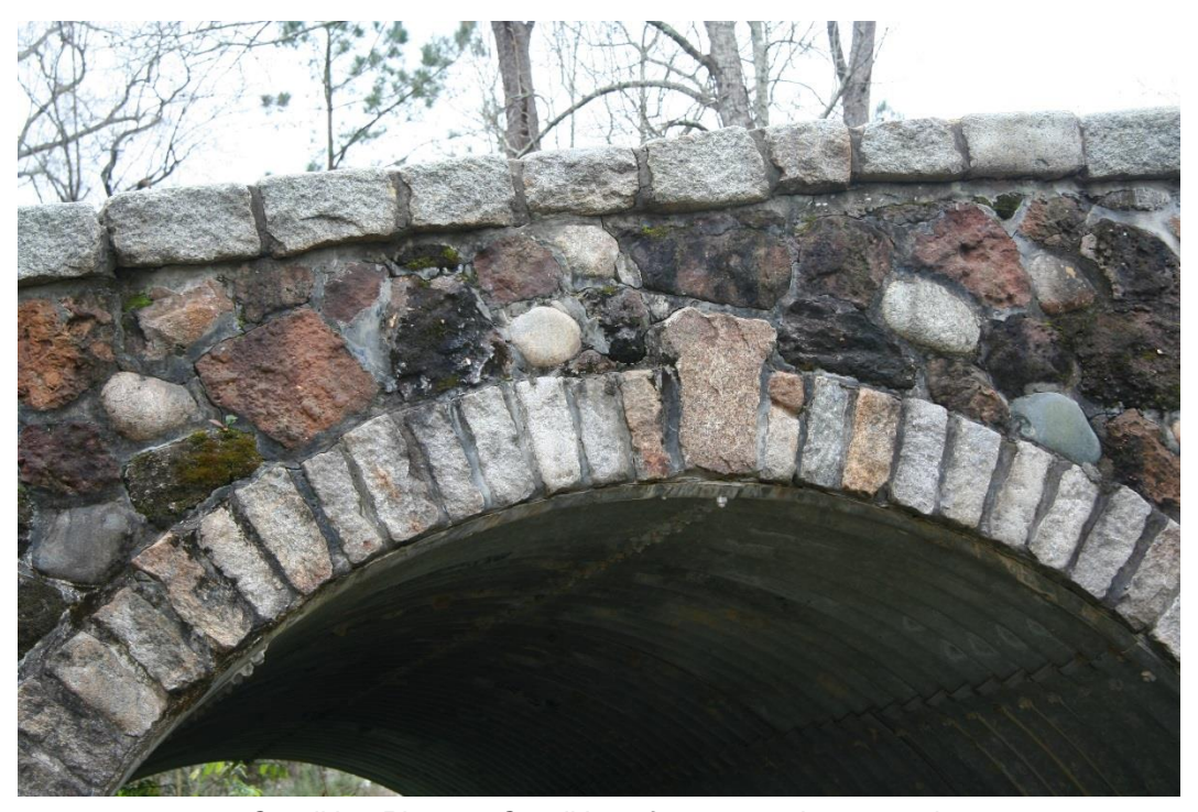
Condition Photo 7: Condition of mortar and stonework.