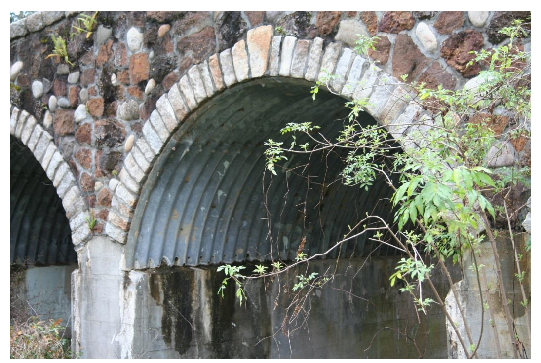
Condition Photo 5: Metal liner plate, stonework, and cast-in-place concrete foundation wall details.