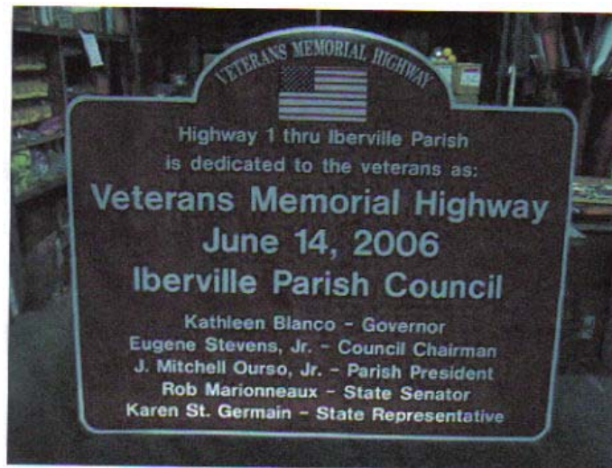
Figure 2M.1.3 Example of a Memorial Marker

The District Traffic Operations Engineer shall recommend for approval and the Traffic Engineering Management Administrator shall approve.