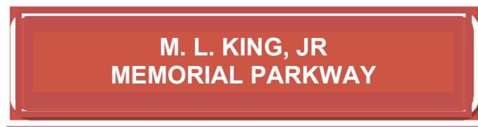
Figure 2M.1.1 Example DOTD Memorial Guide Sign

Traffic Engineering Management (section 77) shall review the Acts of Legislature directing DOTD to install the memorial sign and shall then send the sign fabrication request to Traffic Services (section 45). Traffic Services shall fabricate the sign for the District to install unless the sign is on the interstate. If the sign is located on the interstate, Traffic Services shall install it.