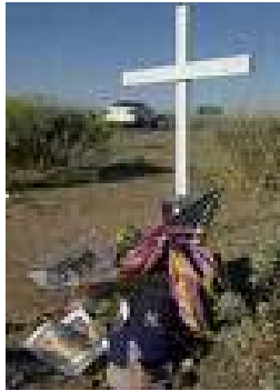
Figure 2M.1.4 Unofficial Roadside Memorial

Unofficial roadside memorials consisting of crosses, flowers, ribbons, or other items are occasionally placed by friends or relatives on highways at or near the site of crashes which involve fatalities. Such encroachments on DOTD right of way and are illegal (LA R.S. 48: 347). However, DOTD does not regularly remove such memorials unless complaints are received, an unreasonable safety hazard is created, or they interfere with routine mowing and roadside maintenance functions.