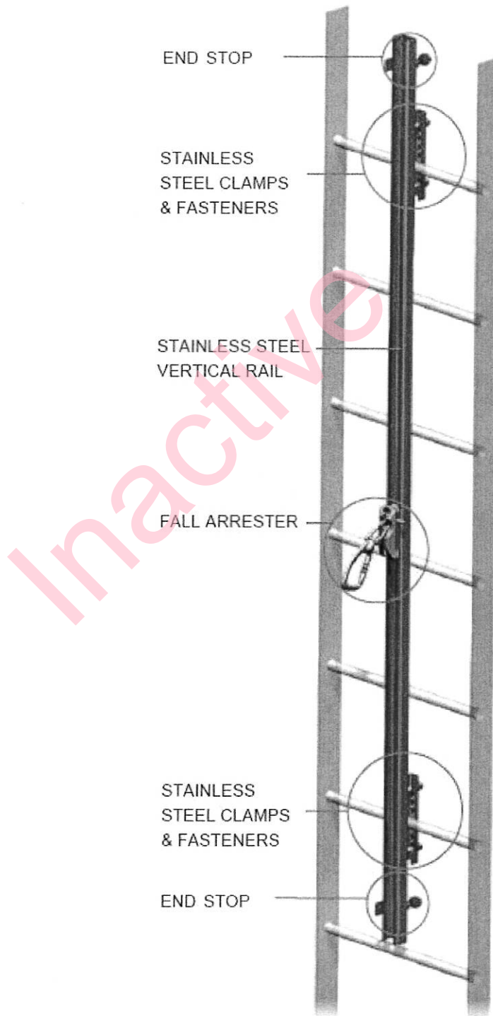
BDTM. 81 Attachment: Sample Ladder Safety System (For Information Only)